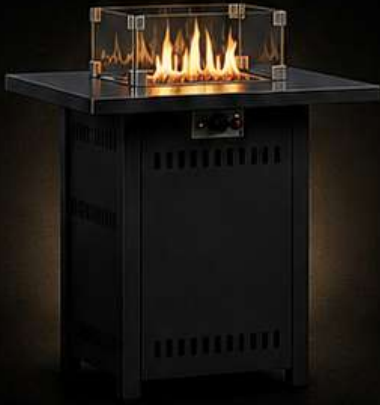
SQUARE FIRE TABLE

← WIDTH → HEIGHT → DEPTH ← 46 cm → 130 cm → 46 cm