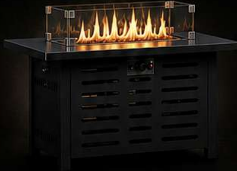
RECTANGULAR FIRE TABLE

← WIDTH → HEIGHT → DEPTH ← 81.1 cm → 100.5 cm → 81.1 cm