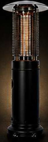
BLACK PYRAMID HEATER

← WIDTH → HEIGHT → DEPTH ← 46 cm → 101.5 cm → 46 cm