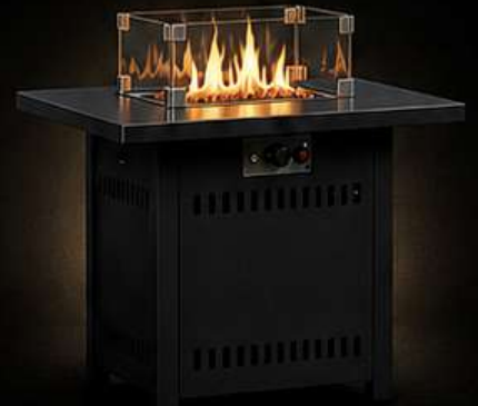
SQUARE FIRE TABLE

← WIDTH → HEIGHT → DEPTH ← 109 cm → 75.5 cm → 56 cm